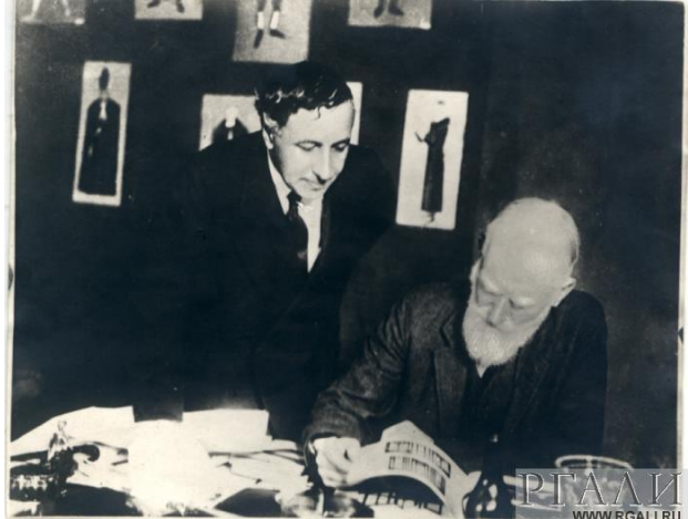
Tairov and Shaw looking at photos of the 1924 production of St. Joan in Tairov's office, 1931