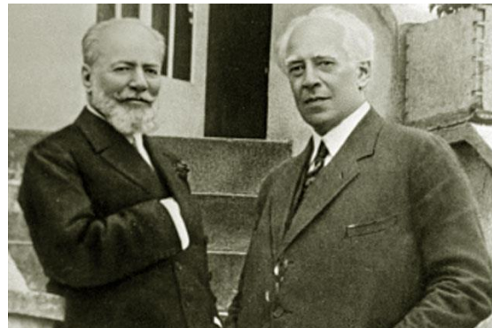
Nemirovich-Danchenko & Stanislavskii