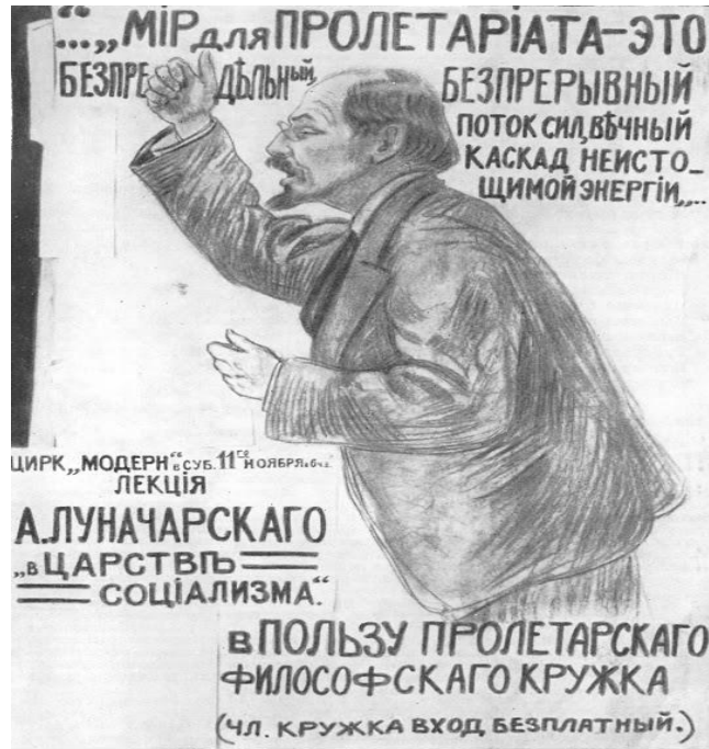
ПЛАКАТ — ОБЪЯВЛЕНИЕ О ЛЕКЦИИ ЛУНАЧАРСКОГО «В ЦАРСТВЕ СОЦИАЛИЗМА» Выступление состоялось 11/24 ноября 1917 г. в цирке «Модерн» в Петрограде