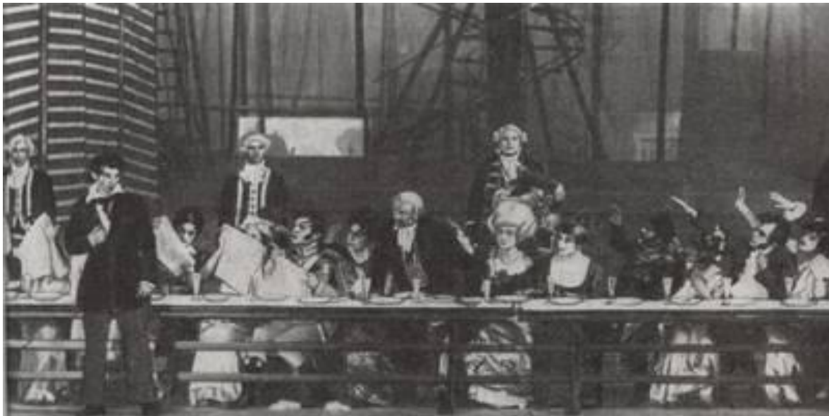
Clockwise from top left: Aleksandr Griboedov; Meierkho'ld, Maiakovskii & Shostakovich; Lunacharskii ca. 1928; Chatskii is presumed mad and ostricized during the banquet scene from Meierkhol'd's production of Woe to Wit