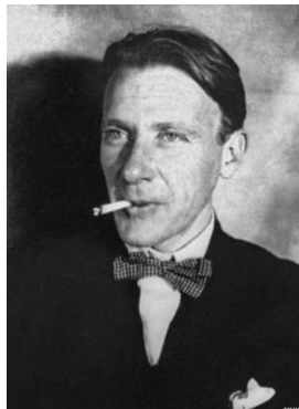
Bulgakov, ca. 1926