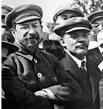
Lunacharskii & Lenin