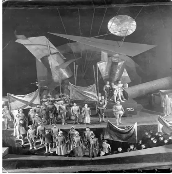
The 1920 production of The Dawns