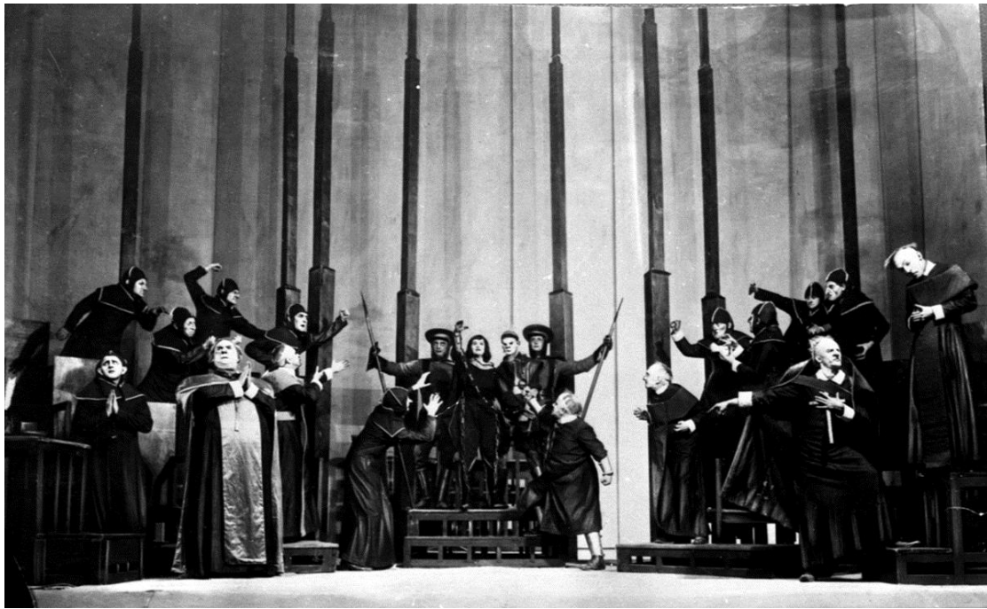
The 1924 production of St. Joan