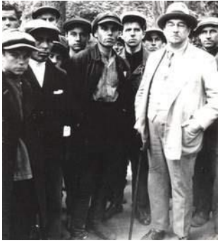
A.V. Lunacharskii & Friends