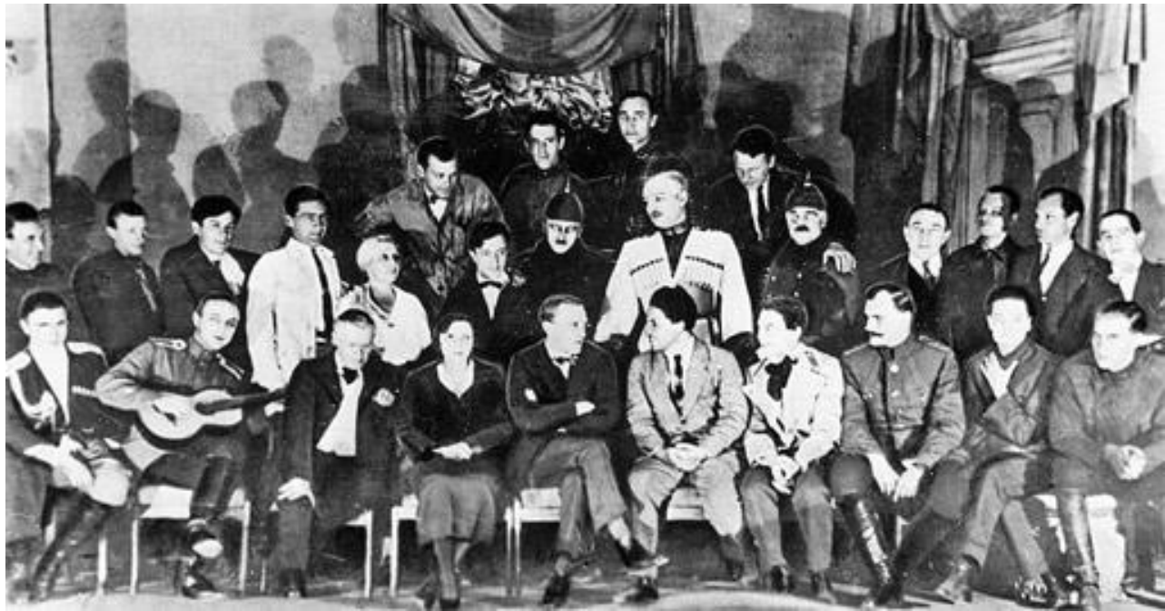
Mikhail Bulgakov (arms folded) and the company from Days of the Turbins