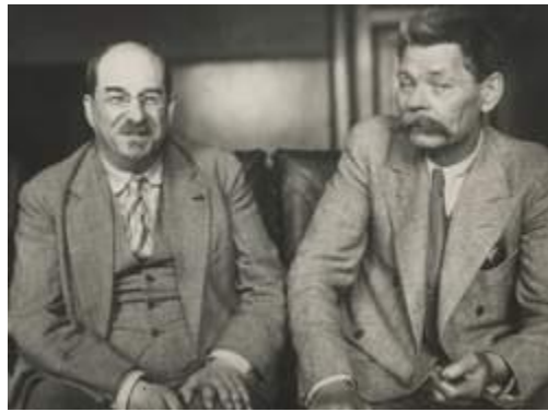
Lunacharskii & Gorkii